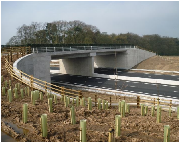
First Green Bridge for Highways England

Contact ABG today to discuss your project specific requirements and discover how ABG past experience and innovative products can help on your project.