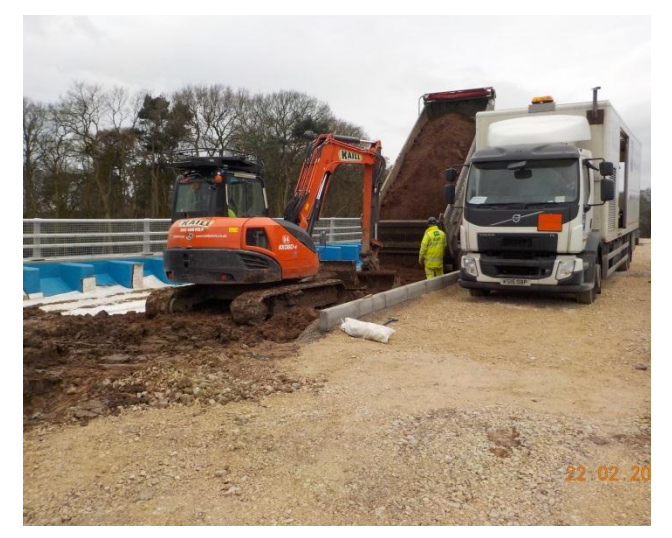
Placing of 600mm of growing media