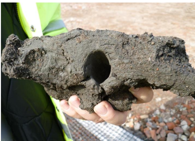
Soft clay ground of 2% CBR was easily deformed by thumb pressure

ABG provided full technical support, including design and installation advice.