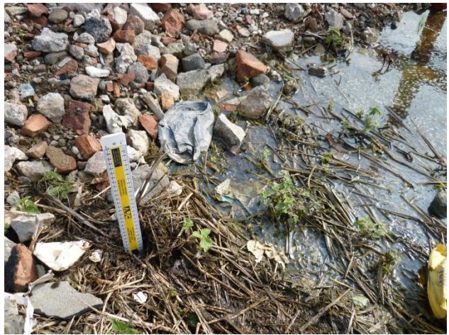
6F2 hardcore was punched into soft and wet weak ground and was lost

DCT's contract manager approached ABG , whose technical team reassuringly calculated that a geosynthetic solution would be both technically viable and cost effective. ABG 's calculations showed that a 400mm layer of 6F2 hardcore laid on to Abgrid 30/30 geogrid with Terrex NW9 geotextile underneath would create a stable surface over a weak 2% CBR ground. The Terrex NW9 geotextile provided separation to prevent soft in-situ ground from squeezing through the geogrid into the 6F2, a solution recommended for all ground conditions of CBR <3% and saving a further 150mm of 6F2. The geogrid provided strength to enable the 6F2 layer thickness to be reduced by approximately 30%, giving a total saving of 400mm of 6F2 on this project. The Terrex NW9 and Abgrid 30/30 were rolled out together, a technique proving significantly cheaper than using a combined geogrid and geotextile all-in-one product.