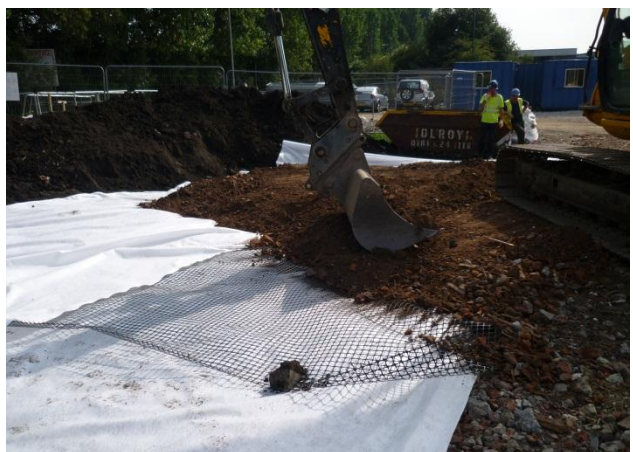
Terrex geotextile and Abgrid geogrid supporting 6F2 hardcore over soft ground

Contact ABG today to discuss your project specific requirements and discover how ABG past experience and innovative products can help on your project.