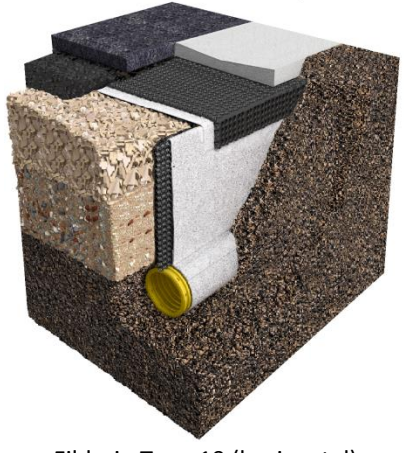
Fildrain Type 10 (horizontal) Fildrain Type 6 (vertical)