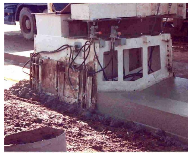
Channel extruded directly onto ABG Fildrain Type 10