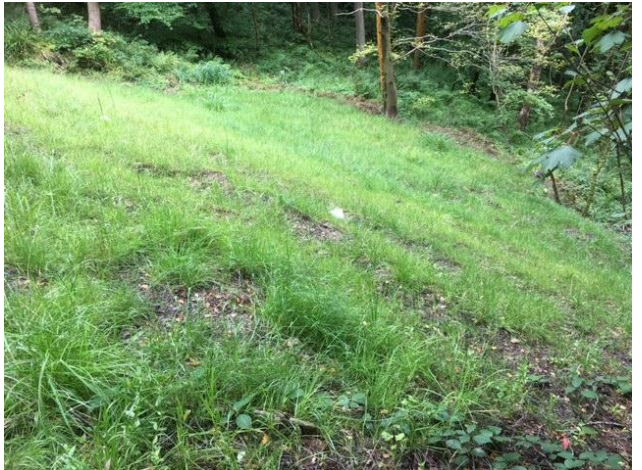
Finished green stabilised embankment

Contact ABG today to discuss your project specific requirements and discover how ABG past experience and innovative products can help on your project.