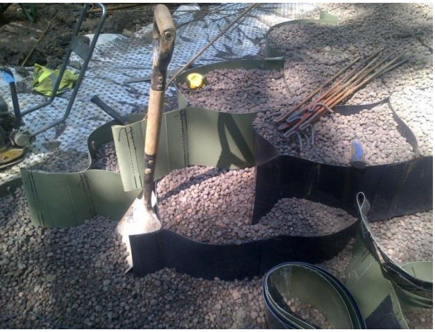
Webwall pinned into place in layers filled with the light-weight aggregate and compacted by hand. This created a stable reinforced retaining structure supporting the road with minimal load on the embankment.