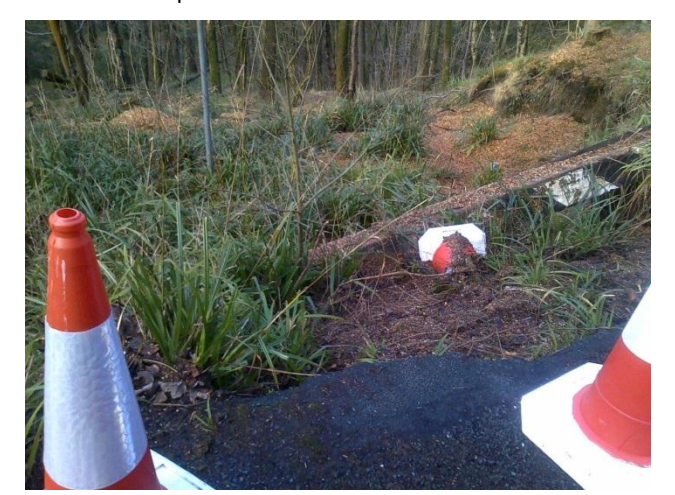
Translational slip cutting into the road causing closure of the road through the Forest of Bowland

ABG provided full technical support, including design and installation supervision.