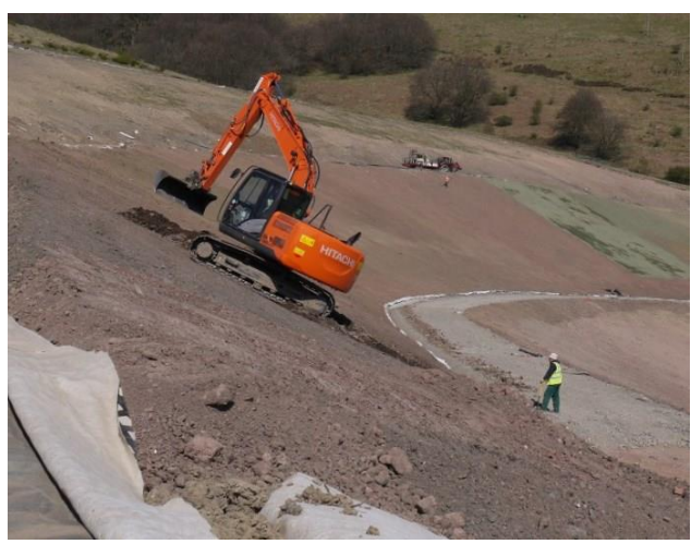
Proving high friction as construction traffic spreads cover soil whilst protecting the geomembrane

ABG proposed the system and provided design and site specific laboratory test results. Site support during the construction and timed deliveries ensured a successful construction.