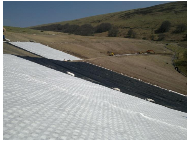
Pozi G with drainage in all directions placed on top of 1mm LLDPE textured liner with