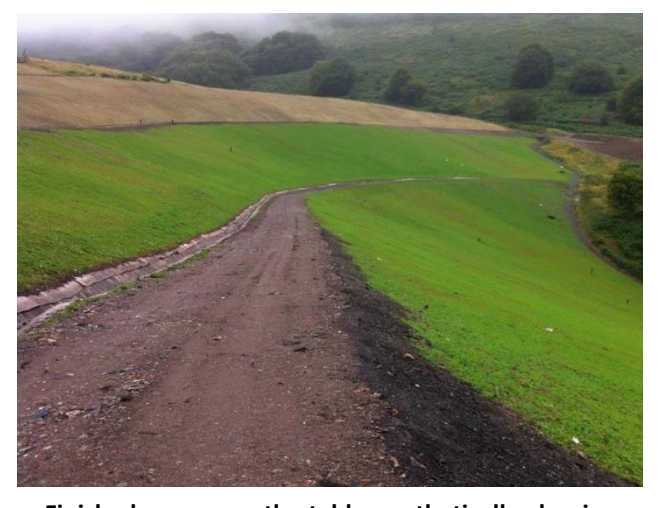
Finished, permanently stable, aesthetically pleasing green slope

Contact ABG today to discuss your project specific requirements and discover how ABG past experience and innovative products can help on your project.