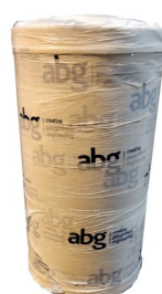
Fig. 4: ABG Roofdrain 60S+RX is supplied in a UV light-proof wrap, to be removed just before installation. Packaged rolls are 0.92m tall x 0.9m diameter, weight approx. 31kg.

abg Ltd. E7 Meltham Mills Rd, Meltham, West Yorkshire, HD9 4DS