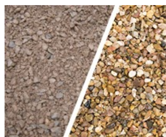
Fig. 9: Cohesive granular fill for hard landscaping (left) or 10mm pea gravel for planted areas (right).