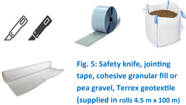
Fig. 5: Safety knife, jointing tape, cohesive granular fill or pea gravel, Terrex geotextile (supplied in rolls 4.5 m x 100 m)

When infilling the cusps, for hard landscaping areas we recommend a lightly compacted cohesive granular fill, or for planted soft landscaped areas using a 10mm pea gravel. (Fig. 9).