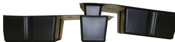
Fig. 8: Interlocking method