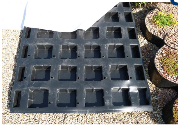
Fig. 1: ABG Roofdrain 60S+RX roof drainage geocomposite. To be filled with lightweight aggregate prior to over-laying with ABG Terrex filter geotextile layer (supplied separately).

ABG Roofdrain can be carried or rolled, but should not be dragged. The packaged rolls are 0.92m tall by 0.9m diameter & weigh approx. 31kg. Unrolled, the product dimensions are 60mm tall x 0.92m wide x 15.2m long.