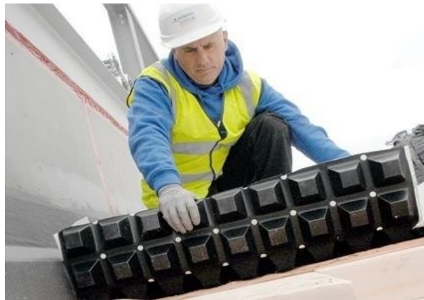
Fig. 6: Lay with geotextile filter & cusate openings facing up.