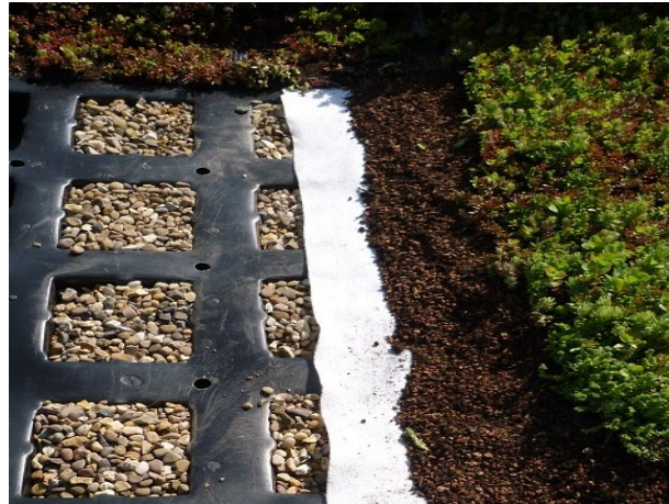
Fig. 10: Infill with stone or gravel before covering with filter geotextile and growing media for planted areas.

Before backfilling inspect the installation to make sure that there are no gaps in the geotextile where soil can enter the core. Ensure that water can exit freely from the ABG Roofdrain if the outlets are along the ends or sides.