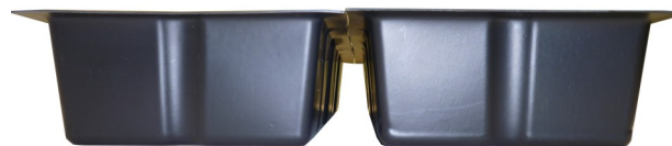
Fig. 7: Butt together and taping method