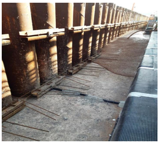
Concrete pour behind CHS pile wall. Deckdrain fixed to existing wall to channel surface & ground water from behind the new wall & promenade structure

Contact ABG today to discuss your project specific requirements and discover how ABG past experience and innovative products can help on your project.