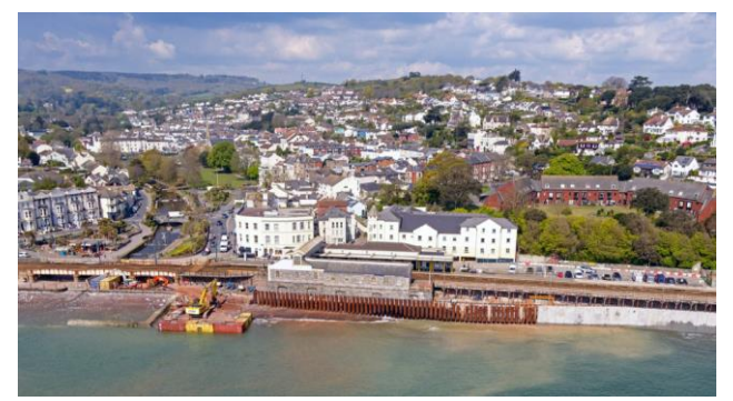
A section of the new, taller sea wall and promenade in front of Dawlish rail station

Design assistance and carbon footprint comparisons for transporting and installing block or stone drainage layers.