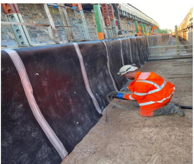
Deckdrain fixed to existing sea wall using Abfix pins & washers to maintain impermeability and jointing tape to prevent concrete ingress