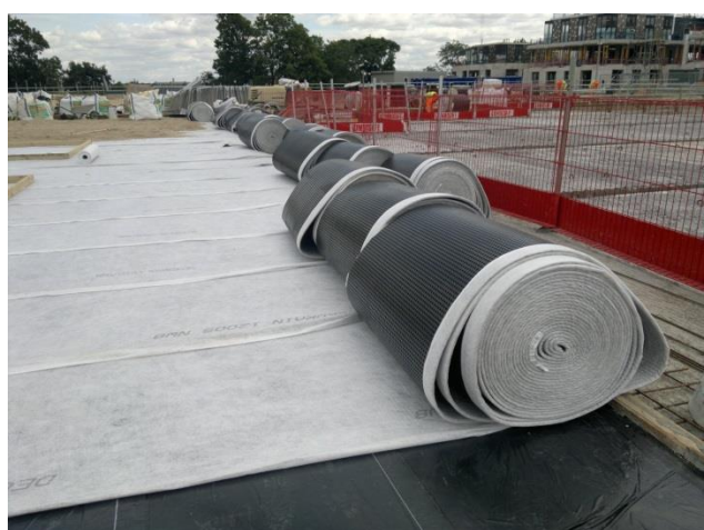
Small rolls of Deckdrain are quickly laid directly on the waterproofing on the concrete roof slab and walls.

ABG provided design advice and technical assistance during installation.