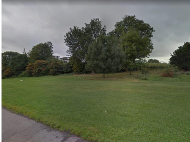
Barrow Hill reservoir blends in with the adjacent Primrose Hill Park

Contact ABG today to discuss your project specific requirements and discover how ABG past experience and innovative products can help on your project.