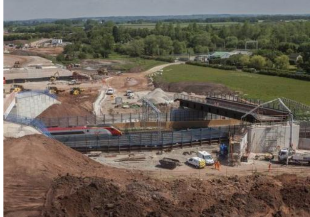
Easy handling and installation means Deckdrain is suited to even the most complex schemes

Water moves easily from the fill soils through into the Deckdrain drainage core, relieving hydrostatic pressure.