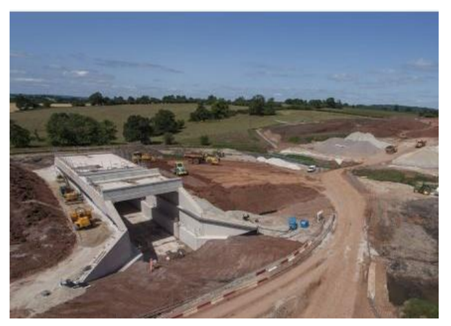
Using Deckdrain drastically reduced the number of vehicle movements on this busy site

ABG provided detailed design calculations and advice, drawings and installation advice.