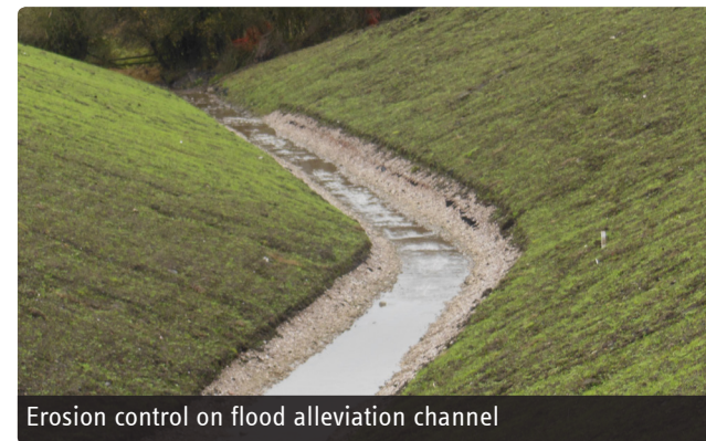
Erosion control on flood alleviation channel

As with all ABG products design advice on which materials are best for your specific requirement and their specification is available from the in-house technical department.