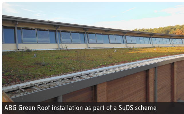
ABG Green Roof installation as part of a SuDS scheme

As with SuDS paving the final design of the system is dependent on the project specific requirements with a number of final surface finishes available including extensive, intensive and biodiverse vegetation along with paved finishes. The drainage/storage capacity is also project specific to meet the requirements of the SuDS design.