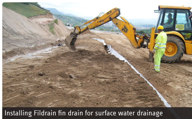
Installing Fildrain fin drain for surface water drainage

Drainage geocomposites offer very high flow capacity, many times that of traditional crushed stone (specific data is available), this is achieved through the unique open structure created by the cusped construction which allows unhindered water flow through the core. Geotextiles ensure that fines do not enter the flow void minimising the occurrence of blockages and allowing continuity of flow through the whole life of the installation.