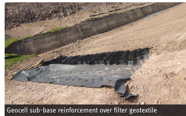
Geocell sub-base reinforcement over filter geotextile

Both woven and non-woven geotextiles are available in a wide range of weights and are suitable for many applications including reinforcement and filtration applications. In filtration applications the properties of the geotextile can contribute significantly to the removal of pollutants of water passing through greatly improving water quality.