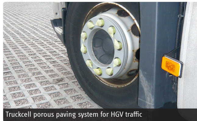
Truckcell porous paving system for HGV traffic

The ABG Sustainable Paving system is configurable to individual project requirements and offers a range of surface solutions to meet the aesthetic and performance requirements. A range of geogrids and geocells can minimise construction depth whilst meeting the structural requirements. In addition high performance geotextiles help treat collected water to meet quality expectations. Finally geocomposites can allow the formation of a free storage void across the paved area to attenuate surface water during storm events.