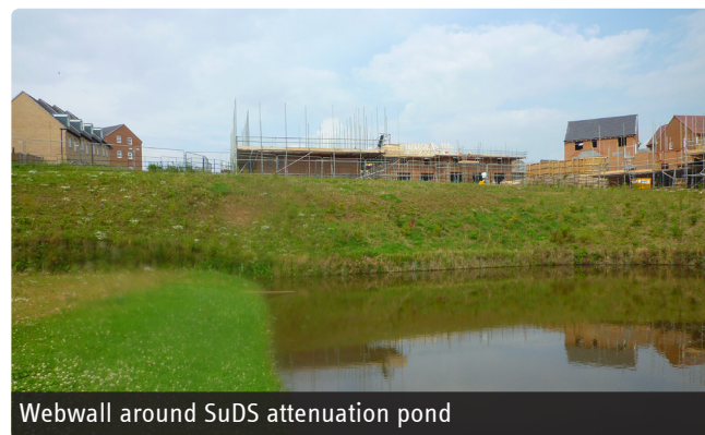
Webwall around SuDS attenuation pond

The Webwall system offers a solution in many SuDS applications with its primary use being in the construction of steep embankments on SuDS structures such as swales, channels and attenuation basins and ponds. Constructing steeper embankments minimises the land take of the structure freeing up more land for development allowing developers to maximise return whilst meeting statutory SuDS requirements.