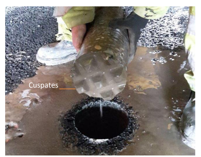
Concrete core sample showing drainage channels