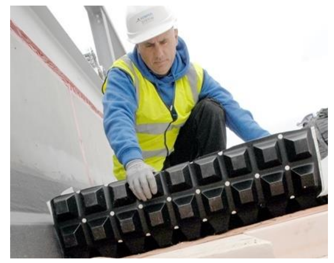
Placing the ABG green roof boards showing the overflow holes which then feed into the blueroof attenuation system below

Provided innovative designed alternatives working with the architect, contractor and waterproofing specialist.