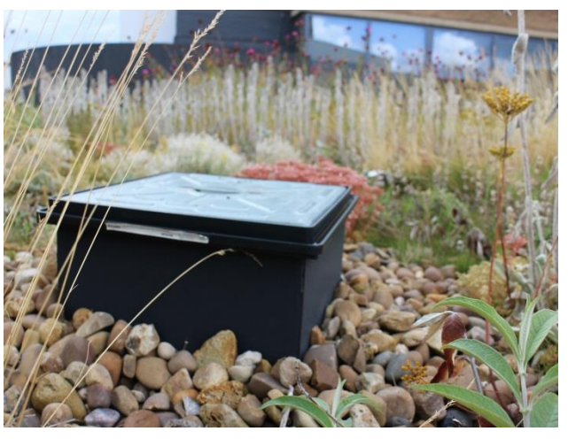
Wildflower growth around the ABG restrictor chamber

Contact ABG today to discuss your project specific requirements and discover how ABG past experience and innovative products can help on your project.