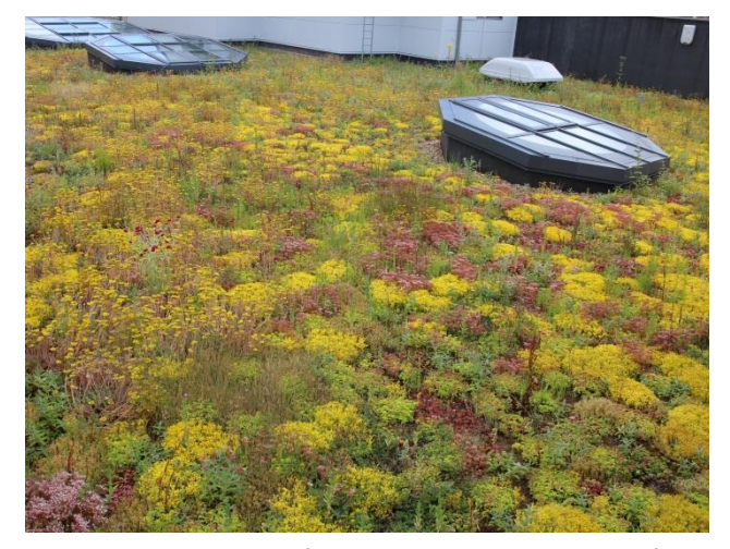
Mature sedum roof overlaying the ABG blueroof attentuation system