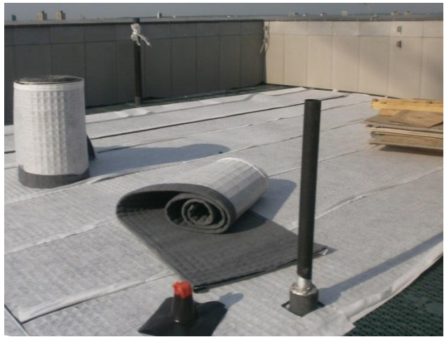
The multi-layer ABG bluroof with water reservoir system on the low level roof area, showing cut outs for penetrations with sealing methods, ready to receive the biodiverse growing media and plants.

ABG with their versatile system and design backup managed to produce the most cost effective solution and eliminated the requirement for attenuation tanks at ground level.