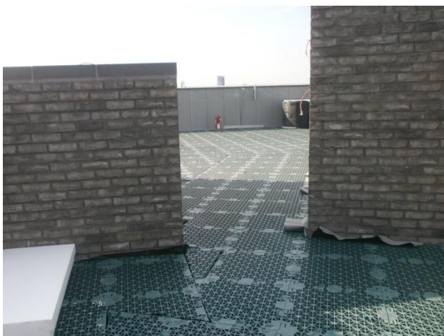
ABG bluroof system cut to suit architectural features