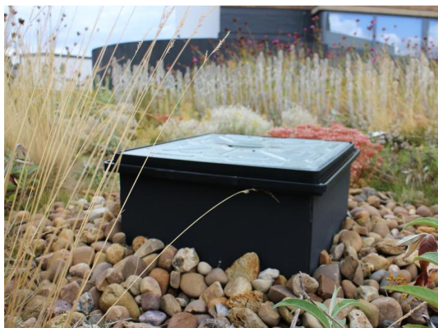
ABG bluroof restrictor chamber in biodiverse roof areas

Contact ABG today to discuss your project specific requirements and discover how ABG past experience and innovative products can help on your project.