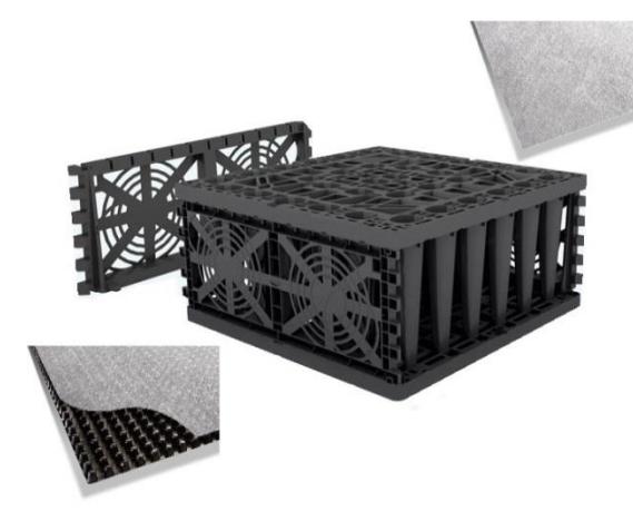
ABG blueroof Type D ; Void Former; Abtex