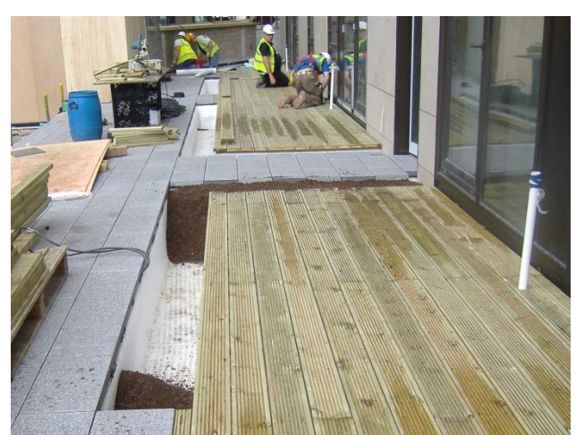
Deep planting trenches filled with NPK light soil

ABG designed, supplied subcontractor Geogreen who installed and delivered the works on time and in budget.