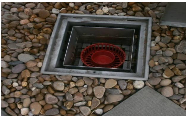
Stainless steel restrictor chamber over RWO