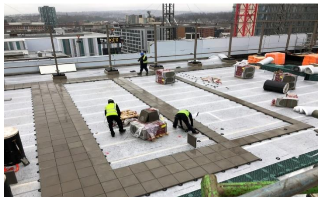
Installing paved finish to Level 60

Contact ABG today to discuss your project specific requirements and discover how ABG past experience and innovative products can help on your project.